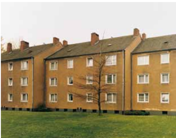
Thomas Ruff Maison N°10 I , 1989 Collection Mudam Luxembourg