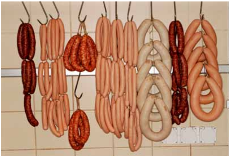
Martin Parr LUX , 2006 Collection Mudam Luxembourg Acquisition 2007