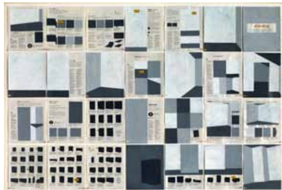
Jochen Gerner Home (ensemble n°6 / Dressing) , 2008 Series of 28 drawings Production and Collection Mudam Luxembourg - Acquisition 2008