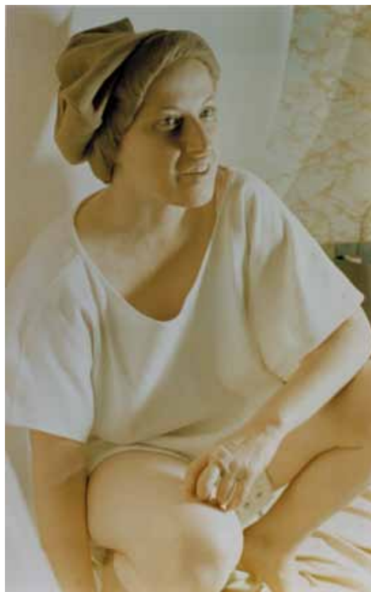
Cindy Sherman Untitled # 120 (Pale Woman) , 1983 Collection Mudam Luxembourg - Acquisition 1996 Apport FOCUNA