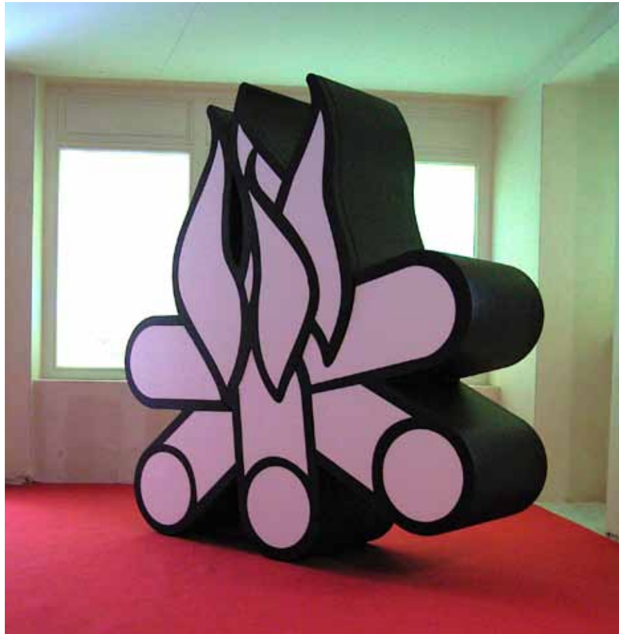
Jean-Christophe Massinon Feu , 2005 Collection Mudam Luxembourg Donation 2006 - The artist