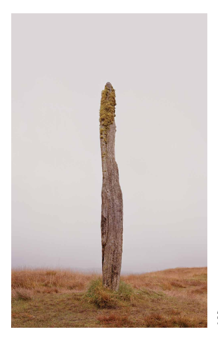
Present Form: Ochd, 2013 Courtesy Jay Joplin, White Cube, London and the artist Photo: Darren Almond

Erected around 5,000 years ago, in a cruciform layout with a central circle, the standing stones of the megalithic site of Callanish, situated on the Isle of Lewis, Scotland, remain an irreducible enigma. Some historians have hypothesised that it is an astronomical observatory, the positions of the Moon aligning with those of the stones at different points in its cycle. This "lunar calendar" would thus be one of the first human constructions intended to quantify the passage of time. The series of photographs entitled Present Form consists of monumental "portraits" of some of these monoliths. Darren Almond paid particular attention to the surrounding atmosphere and variations in daylight. Emphasis is also placed on the surface of each rock, appearing as loaded with thousands of years of exposure to erosion, lichens and surrounding mosses. Despite the imprint left by time, these monoliths have resisted the centuries and civilisations that separate us from their erection, in turn embodying temporal reference points in the history of humanity.