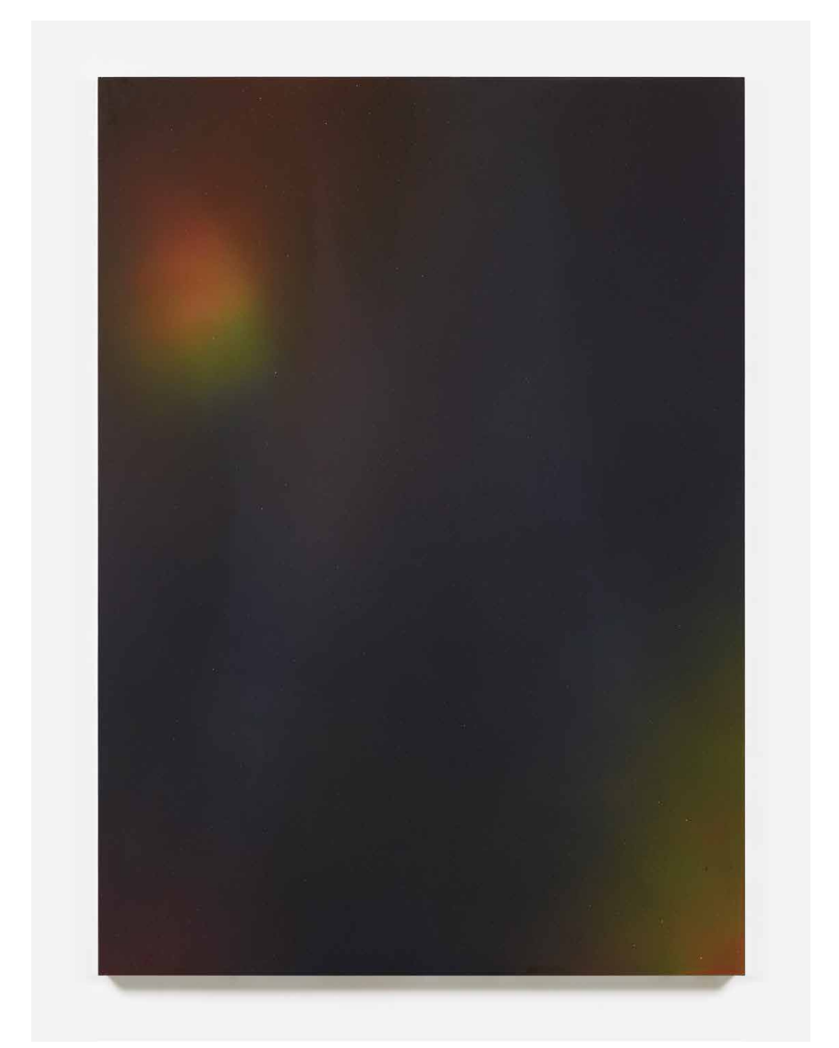
Timescape 23:10, 2016 Courtesy the artist © Photo: def image

In 2013, as he photographed the sky in the "light" of a full moon one night in Patagonia – a region that remains relatively untouched by visual pollution – Darren Almond was fascinated by the spectrum of colours that ran through it. Inspired by views of the deeper space and eager to materialise the impression felt when faced with this night sky, since 2015 he has produced Timescape paintings, "temporal landscapes" or "panoramas of time," that evoke the visible confines of the cosmos. Despite their apparent blackness, these paintings are obtained from numerous layers of different flat colours applied successively on an aluminium support – a process that echoes the views of space that reach us, also subject to interpretation thanks to the application of coloured filters, but also to the paradox raised by Heinrich Olbers in 1826: why is the night sky black when it is constellated with millions of luminous stars? The pictorial compositions of the Timescape series, dotted with tiny white spots resembling stars, are less inclined to scientific accuracy than to a dreamlike and subjective vision of a temporal and spatial beyond that surpasses our knowledge.