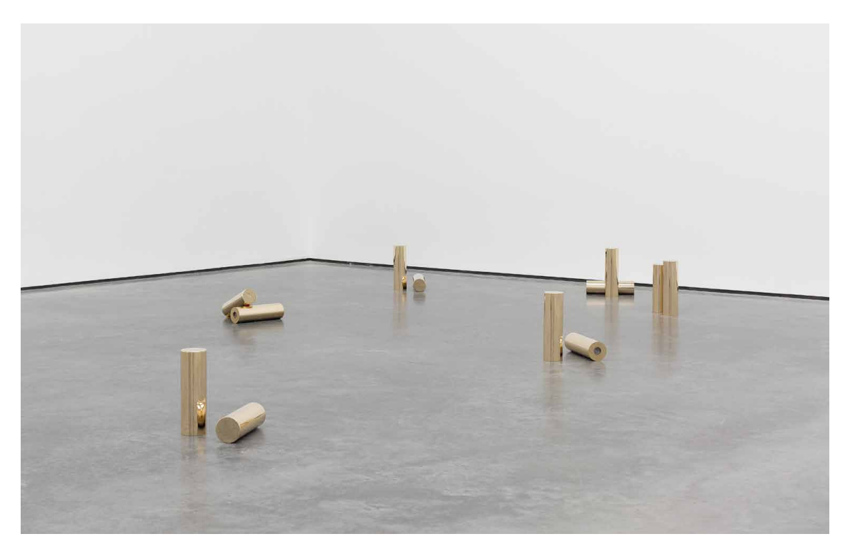
Apollo, 2013

The twelve sculptures that make up the series Apollo , here disseminated in space, relate the history of humans on the Moon: their arrangement in pairs and their titles each refer to the six successful Apollo missions, launched between 1969 and 1972. Individualised with the engraved initials of each astronaut, these bronze cylinders are also filled with lead so that their weight corresponds to the relative weight of each of them on the Moon. Through its ambition – both spatial and political – the Apollo programme veritably brought the Earth's natural satellite into a human scale: by leaving their traces on the Moon, the astronauts established a connection with it, making it into a spatial landmark in our solar system. The human dimension of this enterprise is also perceptible in the protocol of presenting these sculptures recumbent when the astronauts they incarnate are no longer of this world. The scale of distance travelled by them is thus compared with the fleeting nature of all existence, a way of suggesting, in parallel, the trace left by each person on his or her path through life.