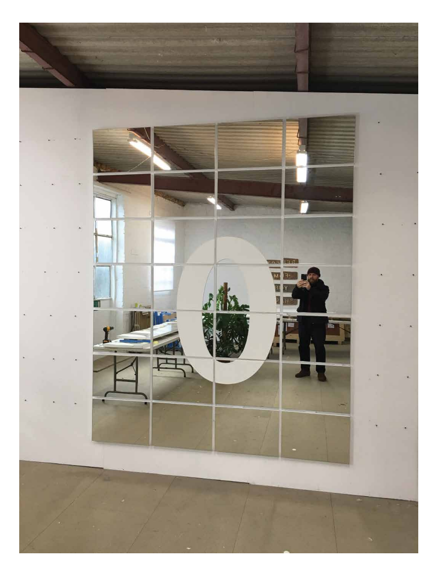
One and Other, 2017 Courtesy the artist

"I am fascinated by the idea that whenever anything seems too far away we turn to numbers. We say: a million, billion, trillion, but we can't really grasp the actual scale of them. [...] I like the abstract quality of maths and the idea that within the abstract realm everything needs to be in balance. You need to have nothing otherwise you can't have anything," says Darren Almond. With these words, he sums up the paradox inherent in the digital language with which man tries to understand and interpret the world around him. Indeed, it is partly thanks to "zero," which relates to nothingness, that it is possible to apprehend the depths of the universe with its scales of time that go way beyond human scales. The work One and Other originated in this degree of abstraction, with the figure zero reproduced on a group of mirrors. It is here associated with two other works from the same series, displaying numerical combinations that are illegible, made up of sets of severed and reversed digits. One thinks of certain scientific data that is vertiginous in its complexity, but also digital clocks suspended between several temporalities – a recurring motif in Almond's work. The ensemble physically integrates the viewer into an interactive experience in which the multiplication of reflections of each observer disturbs relationships with space and time.