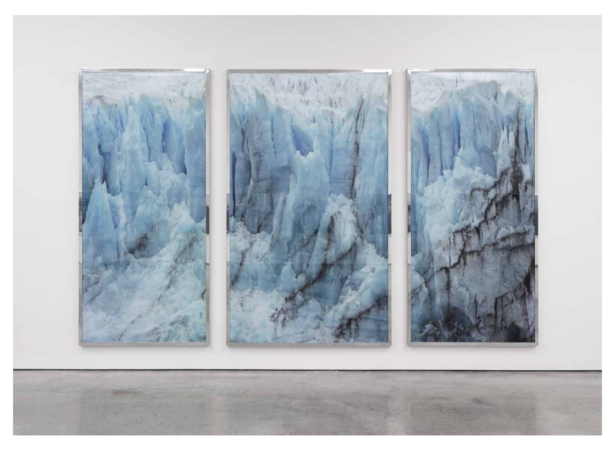
Present Form Exposed, 2013

The photographic triptych Present Form Exposed presents a detailed view of the Perito Moreno glacier in Argentina. The sublime power of the austral ice imposes itself on the eye through close-up framing and the scale of the prints, which reflect the monumentality and density of this ocean of ice. The surface of the icescape, whose pictorial quality is reminiscent of the attraction for this motif felt by painters such as Caspar Wolf or Caspar David Friedrich, carries the stigmata of its successive ruptures: evolving in Lake Argentino, the glacier regularly discards immense blocks of ice in contact with fresh water, revealing its depths over time like geological strata. Such a phenomenon evokes both the way in which glaciers contain fragments of terrestrial history – the ice that forms the core of glaciers could be hundreds of thousands years old – and the most recent scientific research carried out in Antarctica to detect neutrinos, those "phantom" particles resulting from cataclysmic astrophysical events.