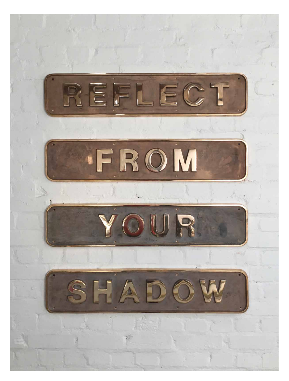
Departure, 2017

At the end of the first exhibition gallery, these few words displayed on train plates invite us to apprehend that which paradoxically emanates from shadows. Although viewed as the negative double of light, the shadow has led to some of the major discoveries in the measurement of time, mathematics and astronomy – it is in the shadow of the sun that it is possible to observe the visible confines of the cosmos. The metaphor of the shadow also intervenes here as a reminder of what is left behind. Like other works in the exhibition, Departure appears to be an injunction to think about how civilisations, at different times in history, have occupied their environment, sometimes leaving permanent traces of their presence. This statement thus crystallises the ecological consciousness that permeates Darren Almond's work.