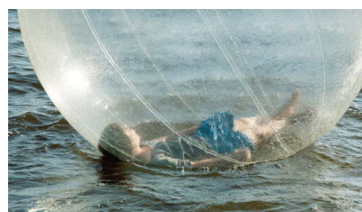
Fiona Tan, History's Future , 2015, © Fiona Tan

Ciné Utopia 16, avenue de la Faïencerie L-1510 Luxembourg (Internationale premiere)