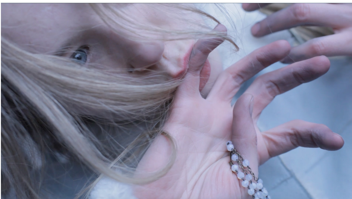
Video still : Martin Eder , Antiquity , 2017 Courtesy Galerie EIGEN + ART Leipzig/Berlin © VG Bild-Kunst, Bonn 2017/Martin Eder