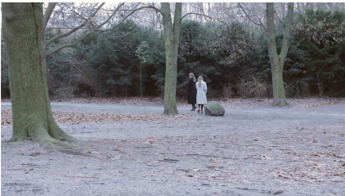
Video still : Martin Eder , Exorcism , 2017 Courtesy Galerie EIGEN + ART Leipzig/Berlin © VG Bild-Kunst, Bonn 2017/Martin Eder