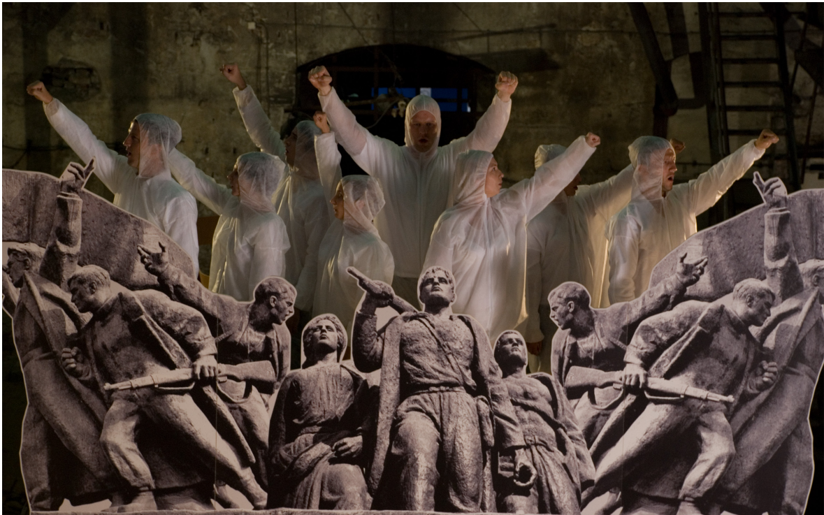
Chto Delat? / What is to be done?, Partisan Songspiel. A Belgrade Story , 2009 Collection Mudam Luxembourg, donation KBL European Private Bankers