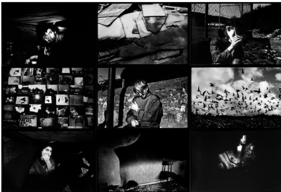
Paulo Nozolino, Casal Ventoso, Lisbon , 1996 Collection Mudam Luxembourg