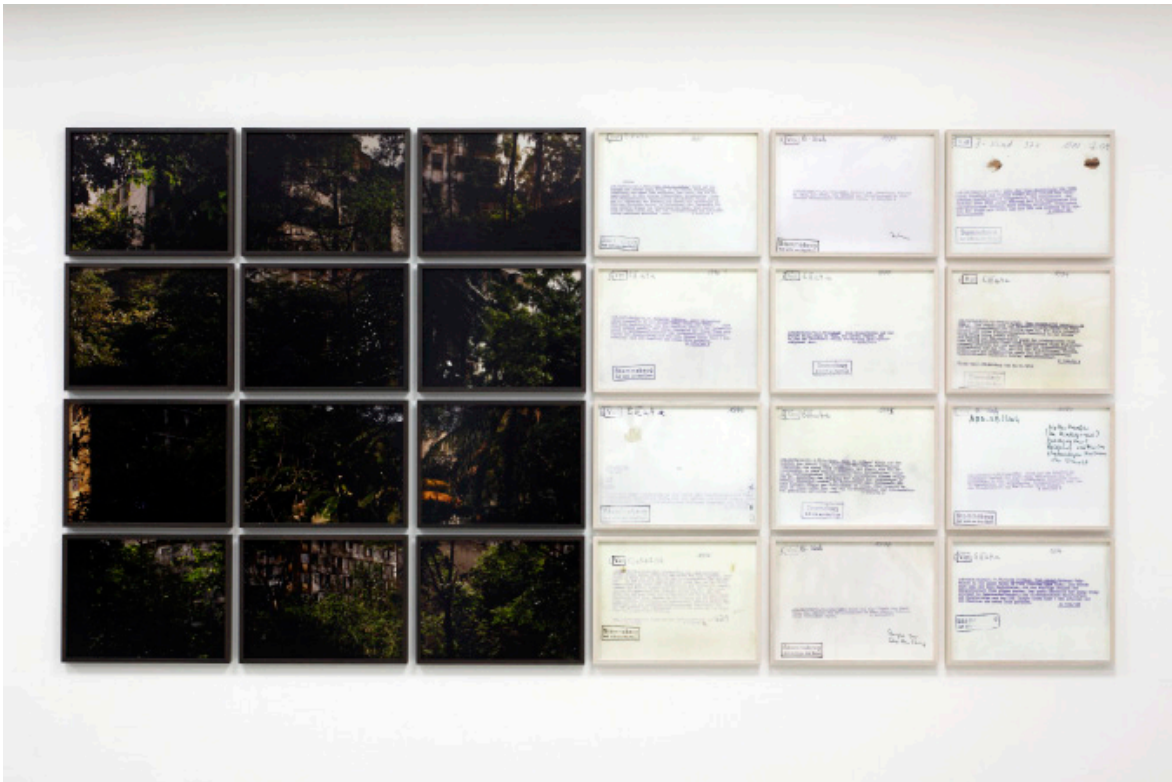
Sven Johné, Bilder der Stadt Vinh , 2009 Collection Mudam Luxembourg, donation KBL European Private Bankers