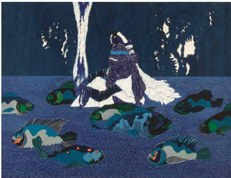
La Nuit (Les Télépathes), 2011 Privat collection, France © Rui Moreira