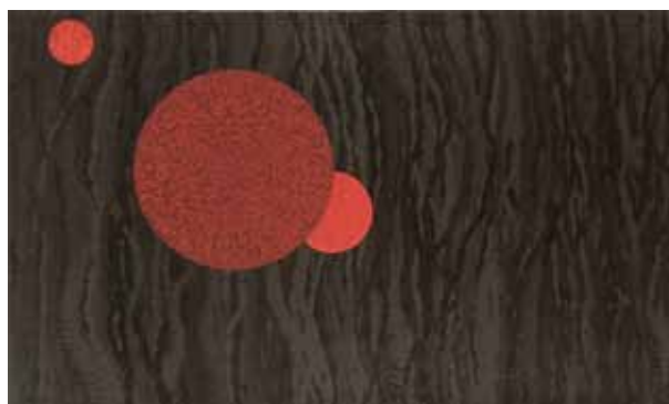
The Holy Family II, 2014 Galerie Jaeger Bucher Collection, Paris © Rui Moreira