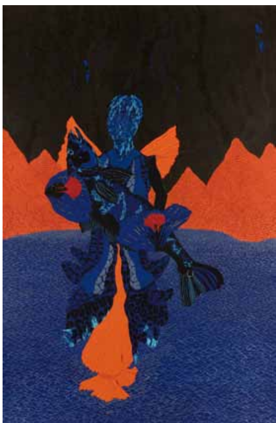
Telepath I, 2013 Galerie Jaeger Bucher Collection, Paris