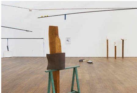
View of the exhibition Katinka Bock. Smog / Tomorrow's Sculpture , Mudam Luxembourg, 2018