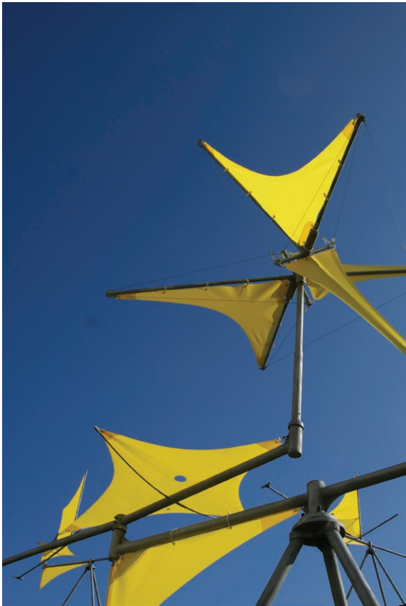
Top: Wind Caravan , 2000 (detail) Courtesy the artist and Galerie Jeanne Bucher Jaeger View of the installation in the Park Dräi Eechelen, Mudam Luxembourg, 2018 © Susumu Shingu