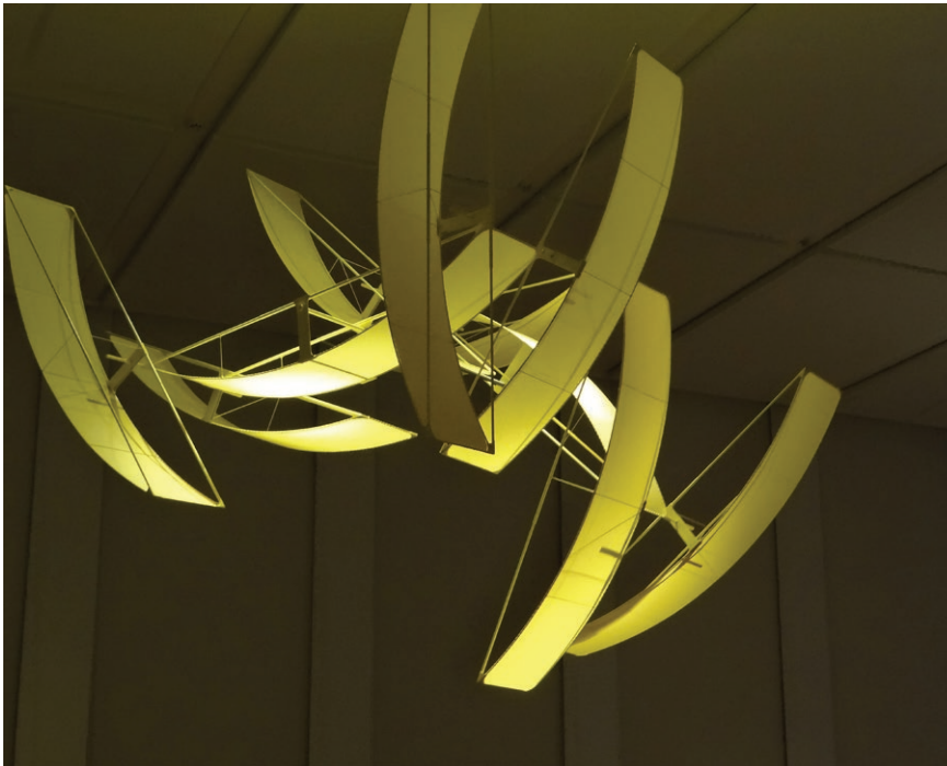
Diary of Clouds , 2016