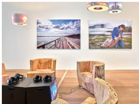
View of the exhibition No Man's Land. Natural Spaces, Testing Grounds , Mudam Luxembourg, 2018