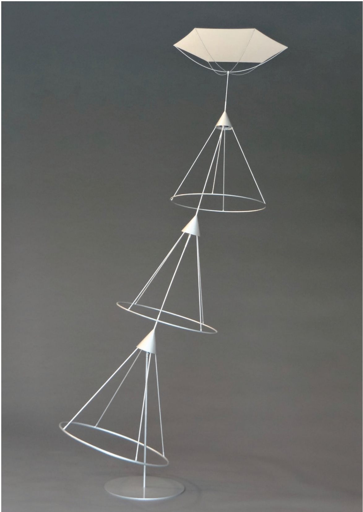
Little Flower , 2013 Courtesy the artist and Galerie Jeanne Bucher Jaeger © Susumu Shiungu