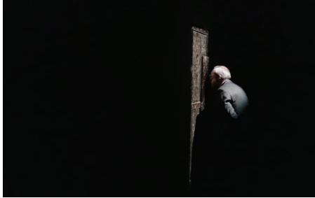
View of the exhibition João Penalva , Mudam Luxembourg, 2018