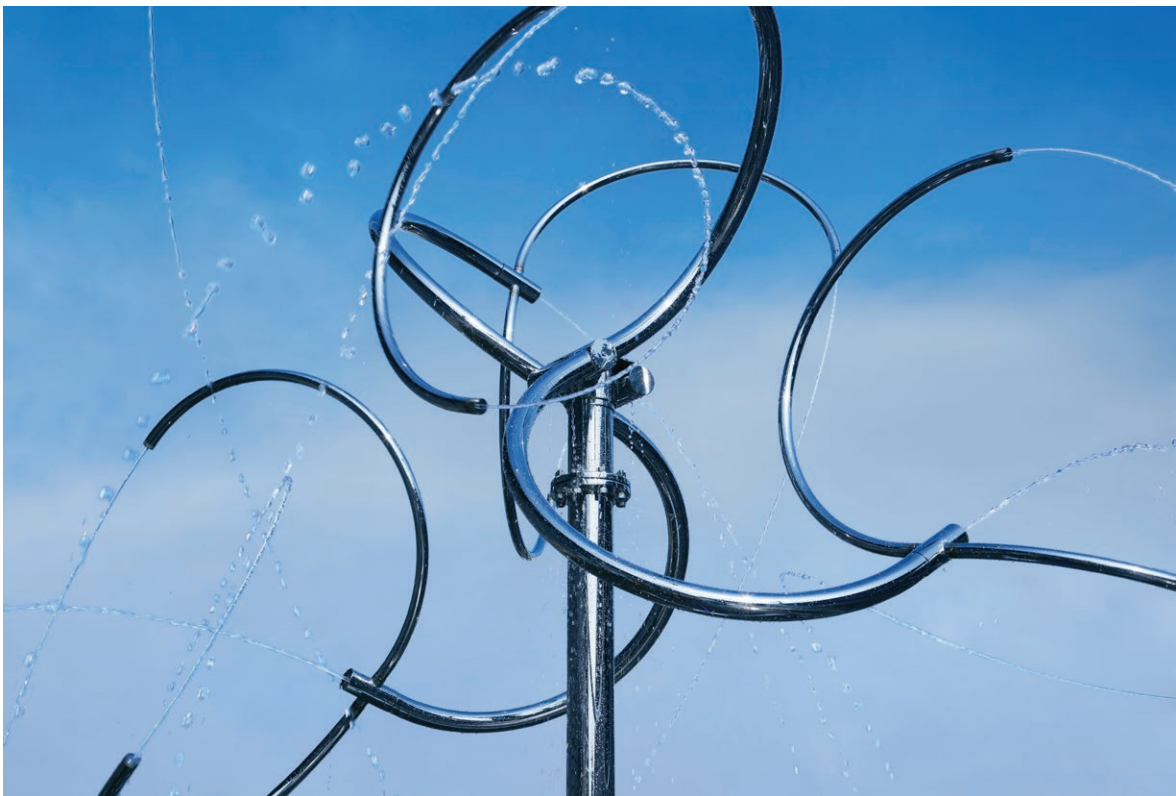
Bottom: Water Tree II , 2018 (detail) Courtesy the artist and Galerie Jeanne Bucher Jaeger © Photo: Yoshiyuki Ikuhara