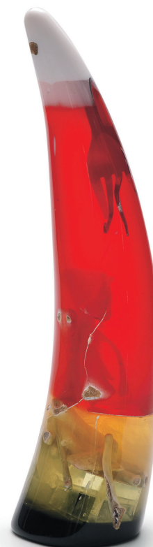
Shane Bradford, Mini Tusk Lemon & Lime Chilli Chicken Jelly