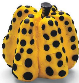
Kusama Yayoi, Pumpkin Cake © Photo: Yayoi Kusama