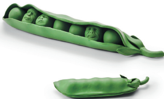
Pierre La Police, Human Beans