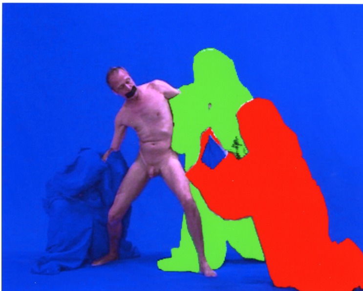
Heimo Zobernig N° 24, 2007 Video projection 14 min 22 sec Collection Mudam Luxembourg