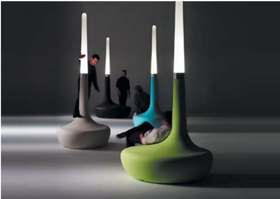
Ross Lovegrove Bd Love Lamp, 2003 Rotomolded polyethylene 300 x 141 x 120 cm

Ross Lovegrove was born in 1958 in Cardiff, Wales, and has worked for companies such as British Airways, Kartell, Cappellini, Phillips and Olympia. His creations have been exhibited in numerous museums, including MoMA, the Guggenheim in New York, the Awis Centre in Japan, the Pompidou Centre in Paris and the London Design Museum (where a section is devoted to him). He has received a number of prizes for his work, most notably the Royal Designer for Industry Award in 2004.