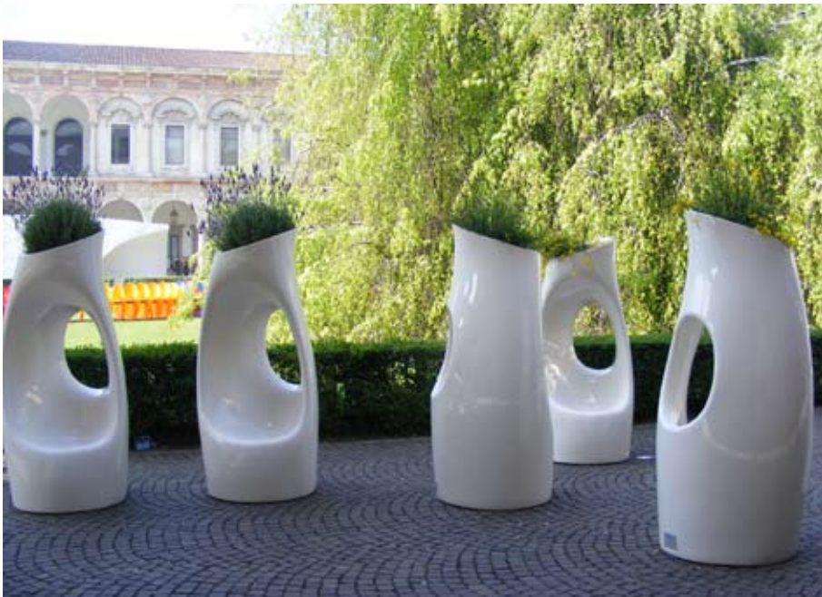
Philippe Starck Holly All , 2008 Polyethylene, brushed steel base 200 x 89 x 92 cm

Philippe Starck was born in Paris in 1949. He lives and works in Ile-de-France. He has been at the cutting edge of the object design scene since the 1980s. Between interior design projects (restaurants, hotels, François Mitterrand's private apartments, etc.), he is above all to be found in numerous collaborations with names currently connected to the production of everyday objects, furniture, sanitary items, appliances, etc. A designer who is into everything, in 1994 he even created an entire house to be sold in kit form for the mail-order catalogue Les 3 Suisses. Philippe Starck is known for having made design accessible and popular.