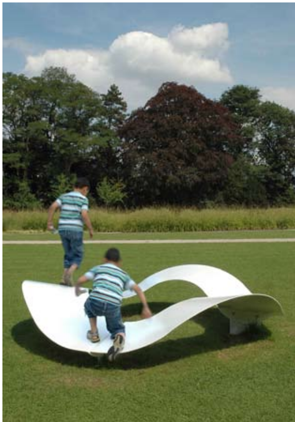
Michael Bihain & Cédric Callewaert Ondine , 2007 245 x 125 x 57 cm Steel, primary zinc, epoxy powder coating Courtesy and © Tôlerie Forézienne

Ondine , the winning project of the Parckdesign 2007 competition, is the fruit of close collaboration between Michael Bihain and the Belgian architect Cédric Callewaert.